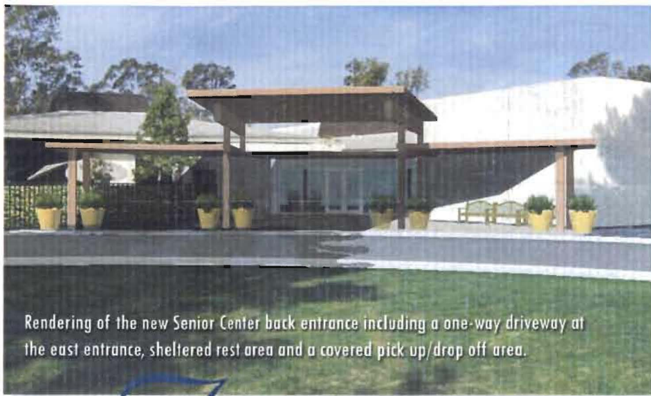
Rendering of the new Senior Center back entrance including a one-way driveway at the east entrance, sheltered rest area and a covered pick up/drop off area.

Twenty-five years ago the Buena Park Senior Center was born, and and since then thousands of people have entered through its doors. Now, by the actions of the City Council, the Senior Citizens Commission and the city administration, expansion and renovation of the Senior Center is a reality and will meet the increasing needs of our current and future populations!